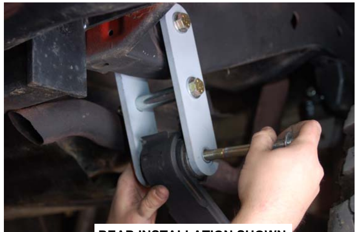
REAR INSTALLATION SHOWN